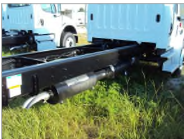
LOCATION OF EXHAUST