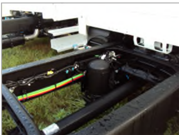
LOCATION OF AIR DRYER (IF REQD)