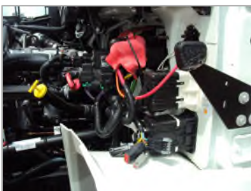
LOCATION OF REMOTE ENG. & TRANS. CONN.