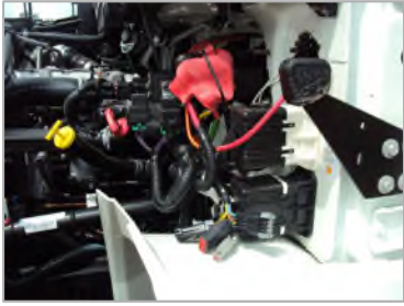
LOCATION OF REMOTE ENGINE CONN.