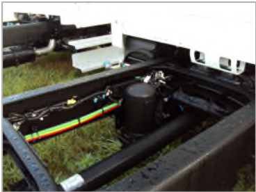
LOCATION OF AIR DRYER (IF REQD)