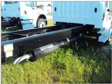
LOCATION OF EXHAUST