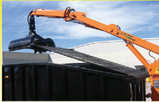
Optional PI self-winding load covering device