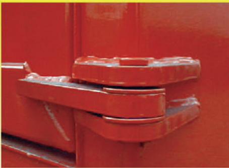
3 greaseless fabricated plate hinges connect each door